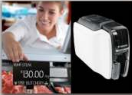
PowerPOP Card and Printer