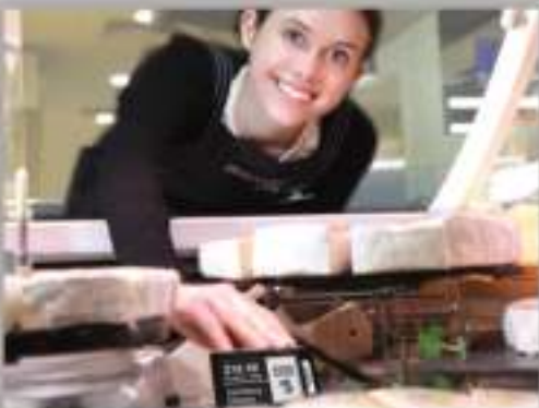
eLabel Hi-Touch Remote Preset Keys