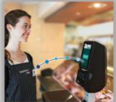
Speed ID with wireless operator identification