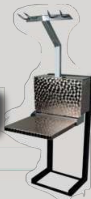
Fold Down Carcass Scale