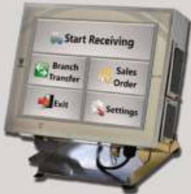
DI-771 with Right Receiving