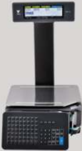
SM-120 P LL