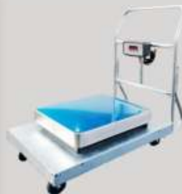
MW-560 Mobile Weigher