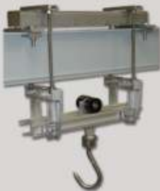
Overhead Track Scale