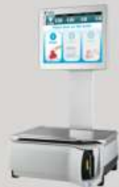
SM-5300 SSP (Self-Service)