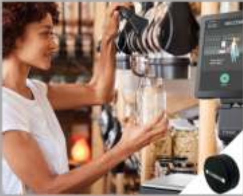
e.Sense mounted to dispenser