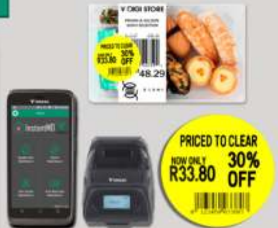
Instant MD Printer, Scanner, Label and Reduced Pack