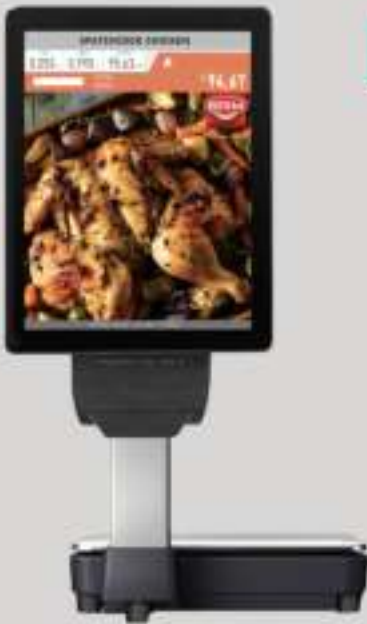
SM-6000 EV PLUS