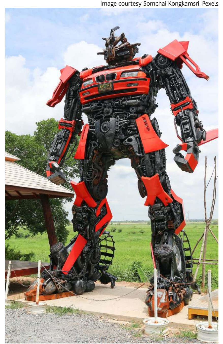
The capacity for adaptability of human workers is set to become a vital component of the automated workplace of the future, contrary to widely-held assumptions about tech-driven changes.

The talks cover a range of issues, but a key theme is flexibility. For example, UPS management wants more flexible work contracts that allow the company to flex with changing market conditions. Port employers want the flexibility to introduce more automation to remain competitive.