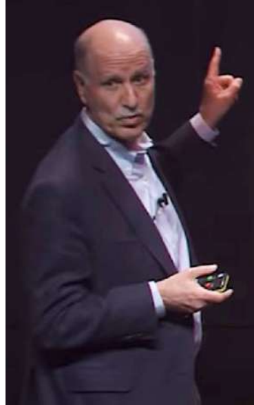
Reprinted from www.supplychain247.com/ May 18, 2023

The capacity for adaptability of human workers is set to become a vital component of the automated workplace of the future, contrary to widely-held assumptions about tech-driven changes.