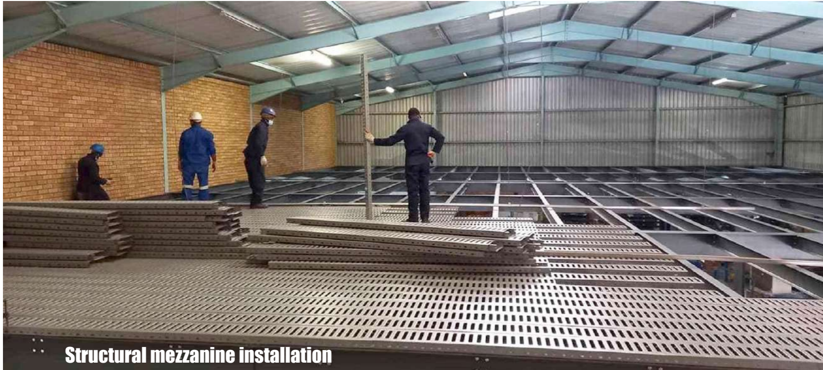
Structural mezzanine installation

are upskilling programs available which gives the keen employee the opportunity to grow. We drive a solution driven attitude with an open-door policy.